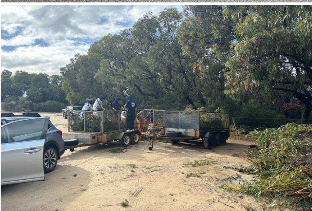
And unload it again at Tims carpark!