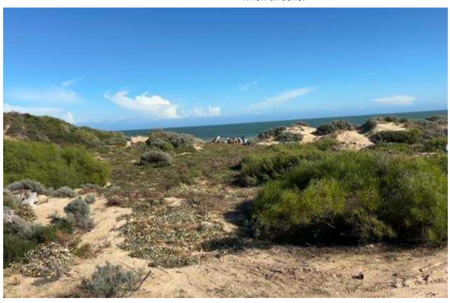
Whew all done!

So then a small team spreads it all over the site, ably assisted by Mel & Sophie.