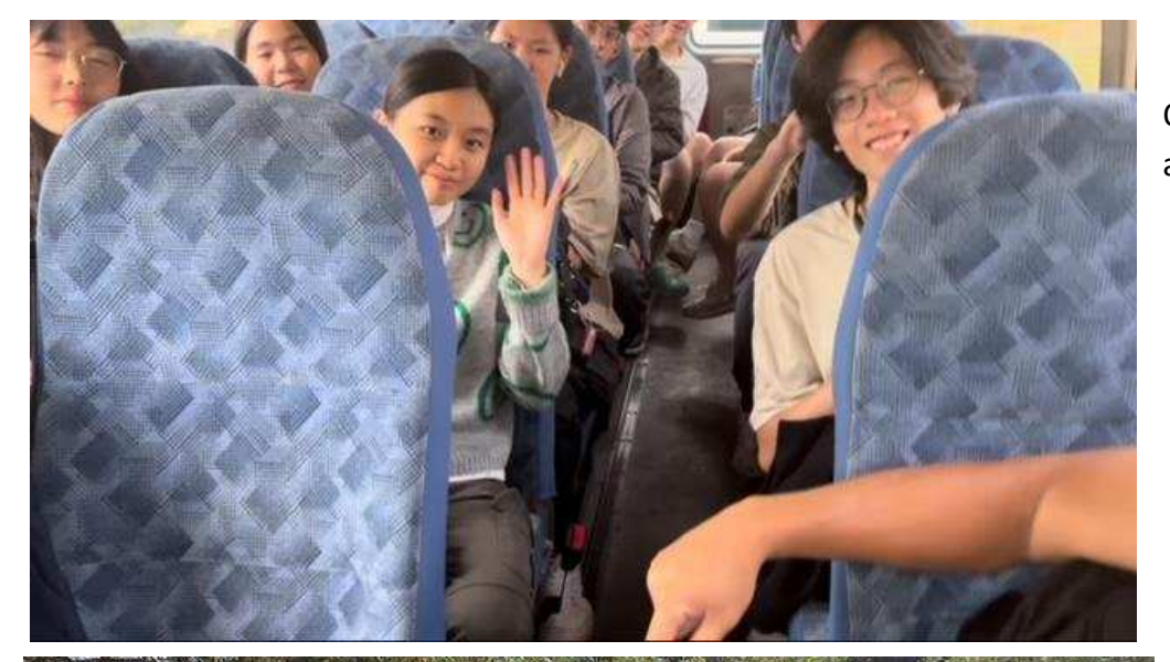
Our Singapore Students arrive to help!