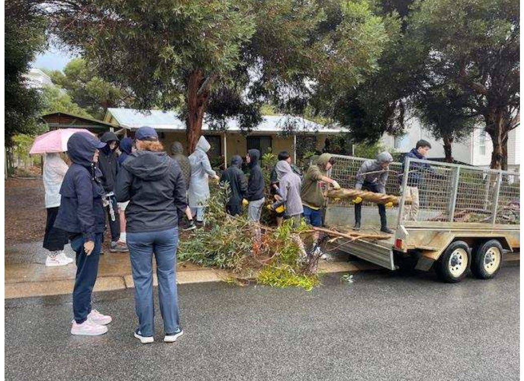
And get to work loading brush...