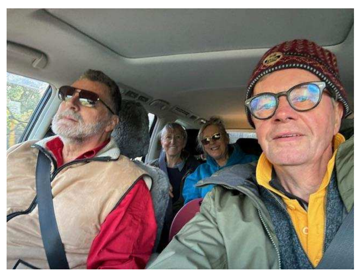
Planting starts with Peel 4x4 Club transporting everyone to site,