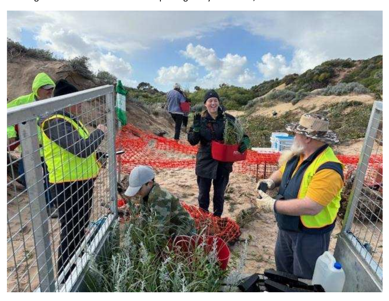
Where planting begins in earnest.