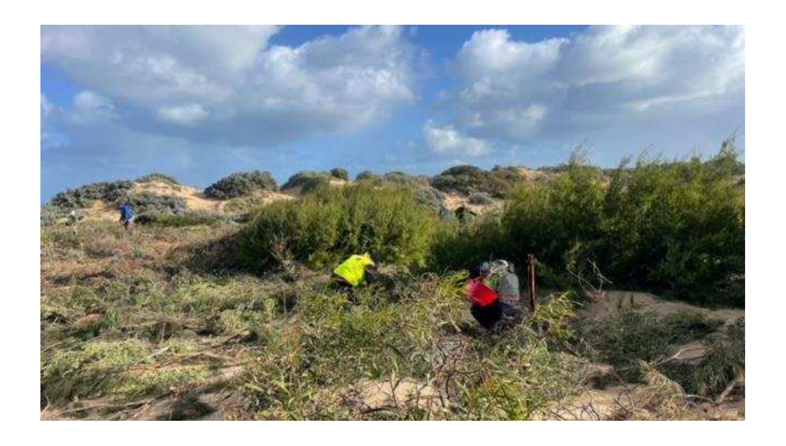
Planting gets going all over the site,