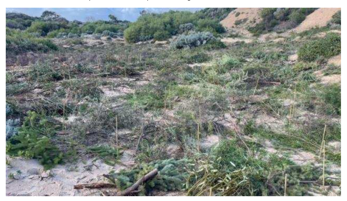
All done - sticks mark the spots – over 1000+ plants in the ground!

while Lauren and the boys take a moment.